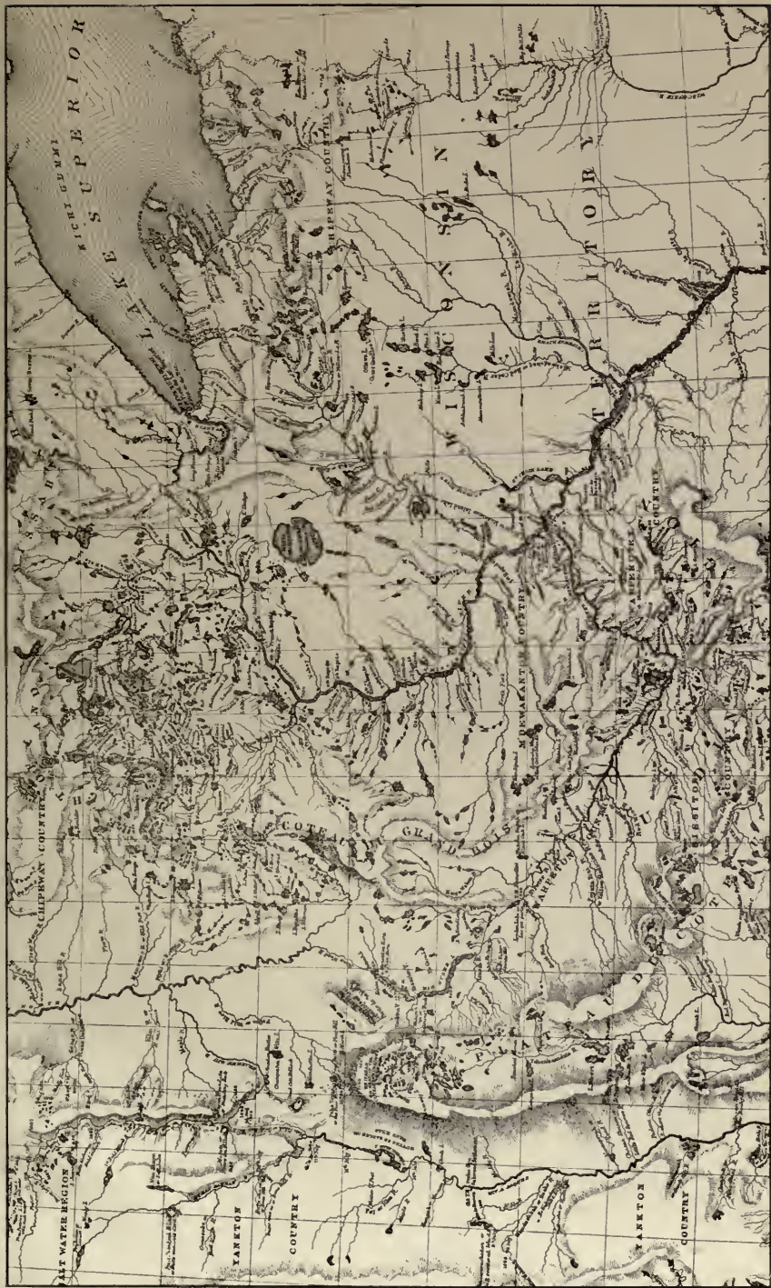
NICOLET'S UPPER MISSISSIPPI—1842.